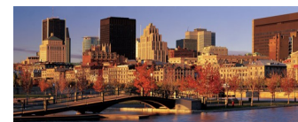
Montréal skyline from the Old Port

“WE HAVE CHANGED OUR NAME TO BE MORE INCLUSIVE, ACKNOWLEDG- ING OUR MANY POSTDOCTORAL MEMBERS.”