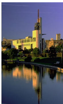
Pointe-à-Callière, Montréal Museum of Archaeology and History

STUDENT DISSERTATION WORKSHOP: “APPLICATIONS MUST BE RECEIVED BY EMAIL NO LATER THAN FEBRUARY 10, 2011. ”